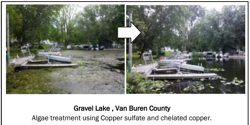
Gravel Lake , Van Buren County Algae treatment using Copper sulfate and chelated copper.

You don't take a photograph, you make it. ~Ansel Adams